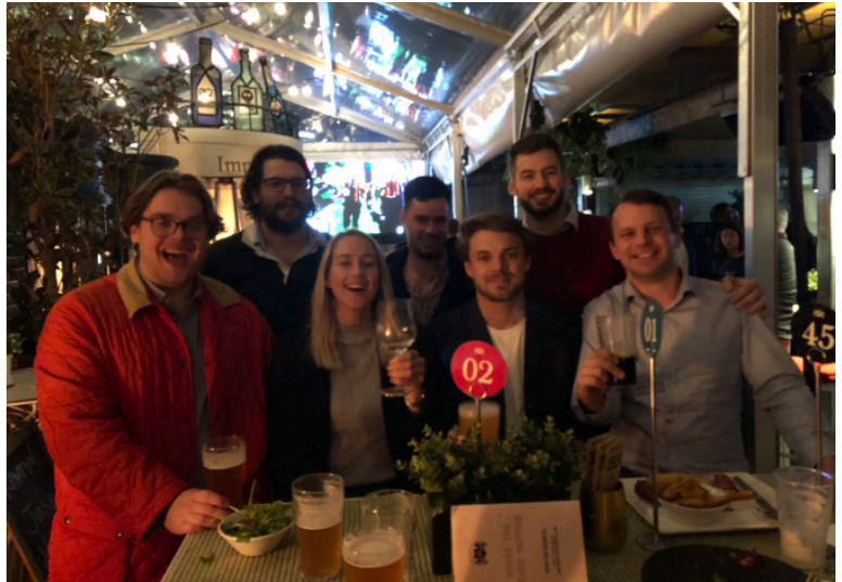
Above: Young Nats catching up at the Imperial Hotel; renowned as a political haunt.

The Young Nationals are always looking for members to grow their team if you know someone or are interested in becoming a member, you can sign up via our website.