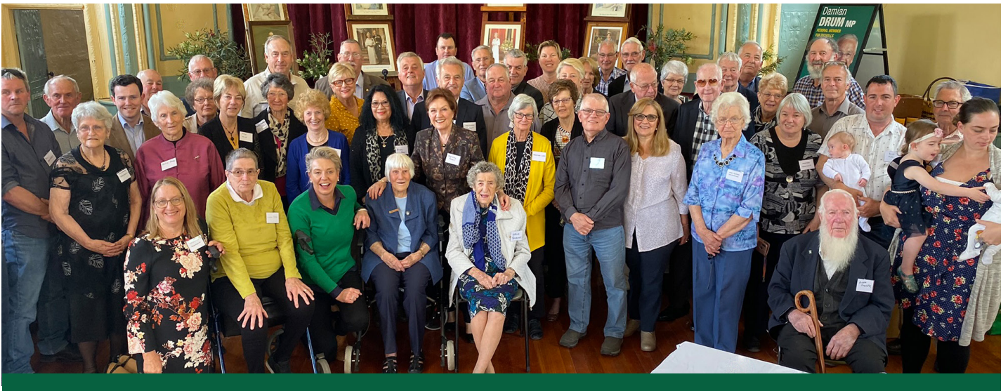
Bottom: 100 year anniversary celebration for the Tallygaroopna Branch in October 2019.